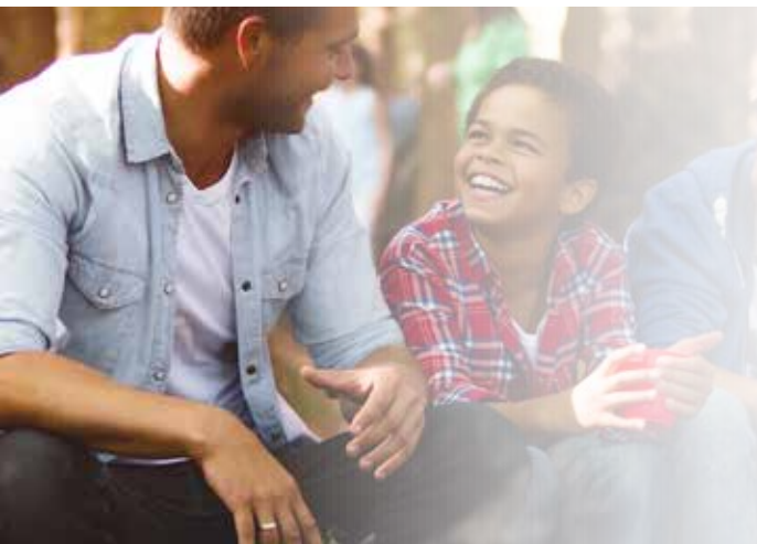
Models in image and intended as illustrative.

In order to protect children from child sexual abuse, protective adults working with kids need to know what behaviours and situations present as high risk. Professional boundaries when working with children are integral to creating healthy relationships and safe environments for kids.